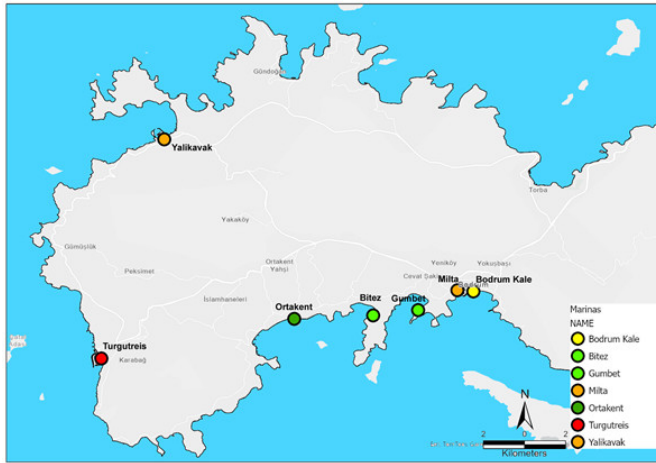
Figure 1: Study area map, the Bodrum Peninsula and seven yacht marinas.