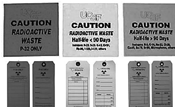
Fig. 1. Radioactive Material Shipping and Transportation.