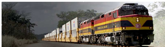
Figure 1: The Panama Railway.