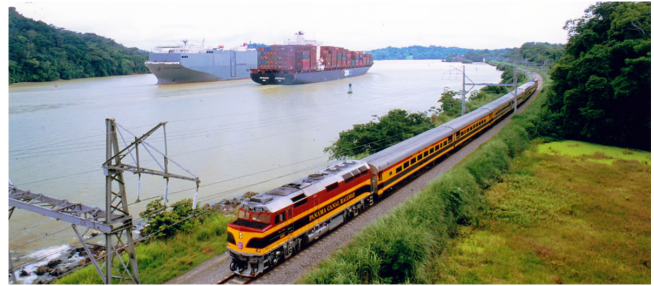
Figure 5: Panama Railway together with the Panama Canal.

It is a common case that uses to happen in Panama. As well the berthing schedules of the liners "could be" the main tool of the intermodal system. But that is the reason why the Panamanian connectivity is a "dynamic" concept with a basic