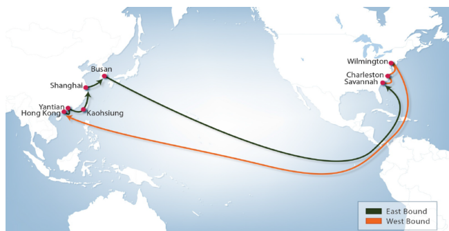
Figure 2: AWY All Water East Coast Service III of Hanjin Shipping