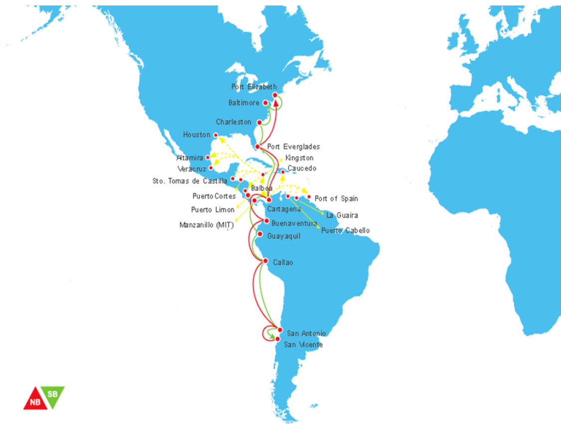
Figure 3: Weekly America's Service of CSAV shipping company.