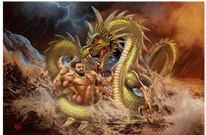
Figure 1: Illustration of Bima's fight with a Dragon.