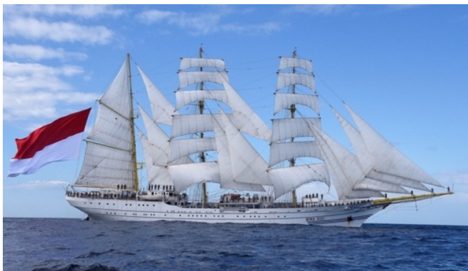
Figure 2: KRI Bima Suci is sailing.