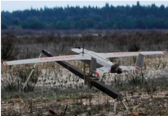
Figure 3: The AR3 Net Ray taking-off.