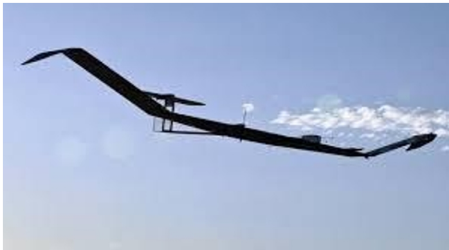
Figure 1: Zephyr.