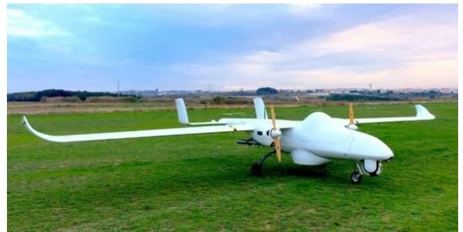
Figure 2: AR5 EVO Unmanned Aerial Vehicle.

The EO/IR systems are imaging systems used for military, airborne homeland security, combat, patrol, surveillance, reconnaissance, and search and rescue programs, which include both visible and infrared sensors. Because they span both visible and infrared wavelengths, the EO/IR systems provide total situational awareness both day and night and in low light conditions. Critical features of EO/IR systems are long-range imaging abilities and image stabilization. The EO/IR sensors are usually mounted on aircraft or vehicles, used at sea, and must be able to identify targets, track them, and assess threats from a distance and in challenging environmental conditions. The EO/IR technology is being fit to smaller payloads, including traditional commercial drones and reconnaissance UAVs, and allow for transmitting live video and high-definition (HD) images back to the operator to improve their awareness and reduce risk to ground forces.