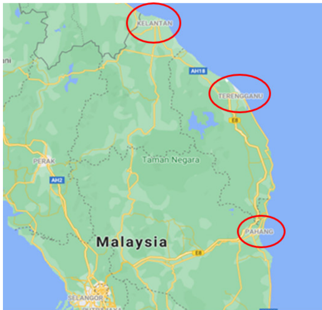
Figure 3: Map of the coastal areas of Kelantan, Pahang, and Terengganu.